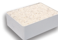
Sand in packs of 2 Kg Code 614.1037.15